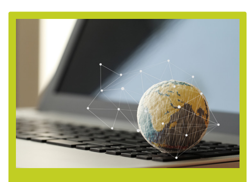
UTILIZE integrated ACH solutions that streamline payments, process management, compliance & reporting